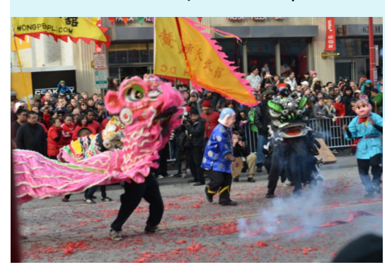
Chinese New Year Parade, Washington, DC